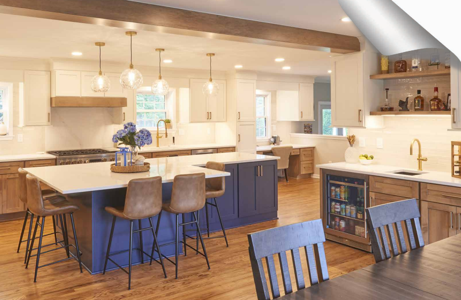
1475 Oakview Drive Columbus 43235